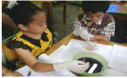
Figure 2 - Student tutors learning about composting

In regard to peer tutorial sessions, the student tutors were given opportunities to select a BTYL sub theme that they would like to teach to their peers. The structure of the tutorial sessions as follows: a) teacher mentor and student tutor introduce themselves and tell the goals of the activity; b) teacher mentor explains about the experiment; c) student tutors demonstrate the experiment; d) teacher mentors divides the students in the class to work in groups; e) student tutor gives the equipment and experiment materials to each group; f) the students work with the student tutor conducting the experiment; g) the teacher mentor makes a documentation; h) teacher mentor opens the class discussion and the student tutor answers the question from the students; i) teacher facilitating the students to conclude the experiment; j) the student tutor and the students clean up the experiment equipment.