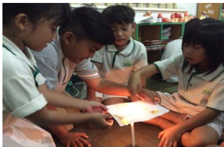
Figure 2 - Students working in group during peer tutorial session

In regard to peer tutorial sessions, the student tutors were given opportunities to select a BTYL sub theme that they would like to teach to their peers. The structure of the tutorial sessions as follows: a) teacher mentor and student tutor introduce themselves and tell the goals of the activity; b) teacher mentor explains about the experiment; c) student tutors demonstrate the experiment; d) teacher mentors divides the students in the class to work in groups; e) student tutor gives the equipment and experiment materials to each group; f) the students work with the student tutor conducting the experiment; g) the teacher mentor makes a documentation; h) teacher mentor opens the class discussion and the student tutor answers the question from the students; i) teacher facilitating the students to conclude the experiment; j) the student tutor and the students clean up the experiment equipment.