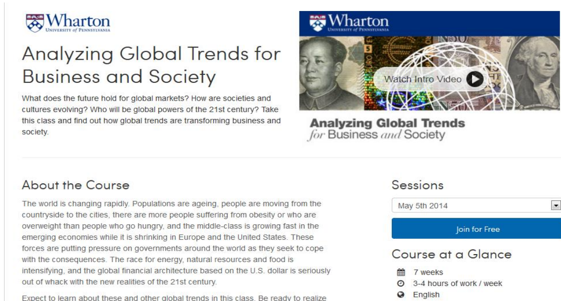
Figure 3 - Example of interactive course offered in MOOC website

provides opportunity for gifted and talented students, who are still in high school and have no access to high level courses offered by universities near their school, to challenge their cognitive ability and sit in a virtual class with individuals who are chronologically more matured than them. Students can learn at their own paces, and choose courses of their interest.