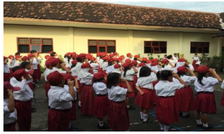
Figure 7 - "This is school assembly, all children are giving salutation to the flag. I wish I could be the student holding 'Pancasila' who stands next to the assembly leader." (Kn, year 4 special class)

In regard to sports, two children with special needs (i.e., a child with low vision and a child on wheel chair) expressed their concerns that they wish to join 'kasti' (local cricket) or soccer. These games were often played during sport lesson but their physical condition does not allow them to do so: "I want to join kasti, I can hit the ball, but I can't run." (Kh, year 5 special class). "I want to play soccer but I can't see the ball." (Lf, year 3, a child with visual impairment in mainstream class)