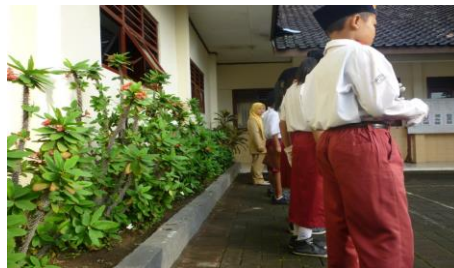
Figure 6 - " This is Dp (a student from mainstream class). He has always been the assembly leader.

Students with special needs at SDK expressed happy feelings when they were told that from now they will be student on duty in the Monday school assembly. Such role in the past was only given to regular students.