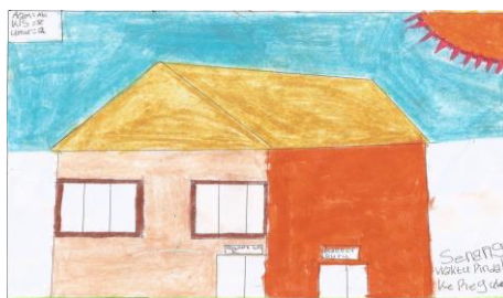
Figure 4 - "I am happy to be moved to mainstream class. I am moved to mainstream class because I can do the lessons." (Ab, year 5 mainstream class)

This type of experience is unique to students at SDK since the school has two types of classes. Some students with special needs have experiences of being moved from special classes to mainstream classes. This experience is viewed as happy experiences with reasons expressed such as more chances to learn, being smarter, study harder, bigger classroom and chances to have more friends.