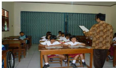
Figure 9 - “This is religion subject, in this subject, inclusion children can join mainstream class. There are K and R (inclusion children) sitting alone. It is better for regular children to sit with inclusion children, because if inclusion children do not know something, regular child can help.” (Ab, year 5 mainstream class)