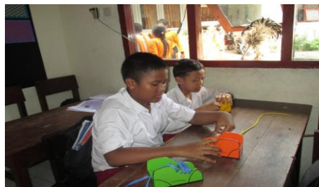
Figure 10 - “This is a good photo because children in year 5 special class are learning how to put shoelaces on. They are learning it because they can’t do it.” (Ki, year 1 special class)

The results from Vi’s inquiry provided children’s understandings of inclusion and what an inclusive school should look like. Meanwhile, Ab and Ki’ findings contributed to the theme of what it means being ‘special’ and ‘regular’.