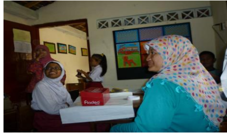
Figure 8 - “Students in special class making gift wrap. Mainstream children can learn things being learnt by inclusion children quickly. Children in special class cannot do what children in mainstream classes, it’s just too difficult for them.” (Ab, year 5 mainstream class)