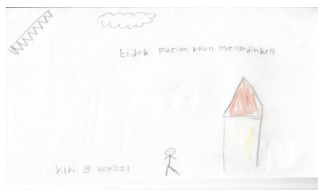
Figure 3 - "This is me, I feel sad because I don't have friends. Children are naughty to me. I am being punched. I want to have friends from special class and mainstream class." (Ki, year 2 special class)