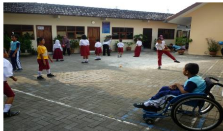
Figure 5 - "This photo shows ball play during therapy session (inclusion day). Students from mainstream class don't need to play because so many subjects to learn to be clever."